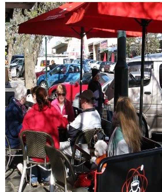
Monty Village Shopping Centre Were Street, Montmorency VIC 3094