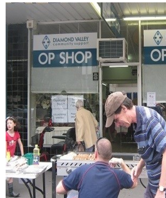
DVCS Op Shop 44 Aberdeen Road, Macleod VIC 3085