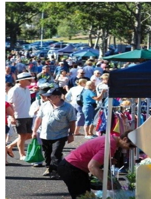
Kingsbury Drive Community Market La Trobe University, Bundoora VIC 3083