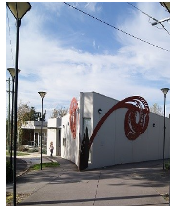
Watsonia Library 4/6 Ibbottson Street, Watsonia VIC 3087