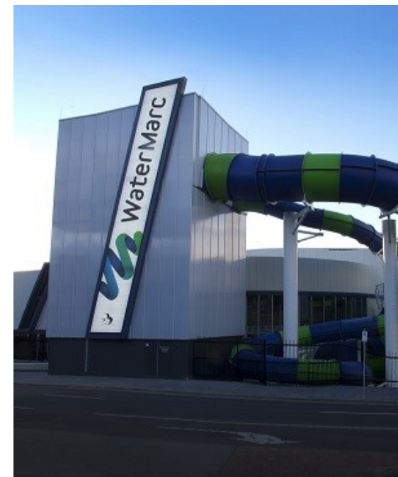
WaterMarc 1 Flintoff Street, Greensborough VIC 3088