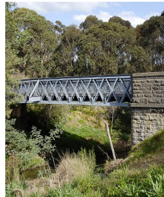
The Old Lower Plenty River Bridge Lower Plenty VIC 3093