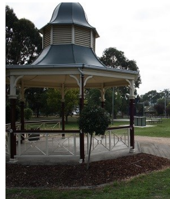
War Memorial Park Henry Street, Greensborough VIC 3088