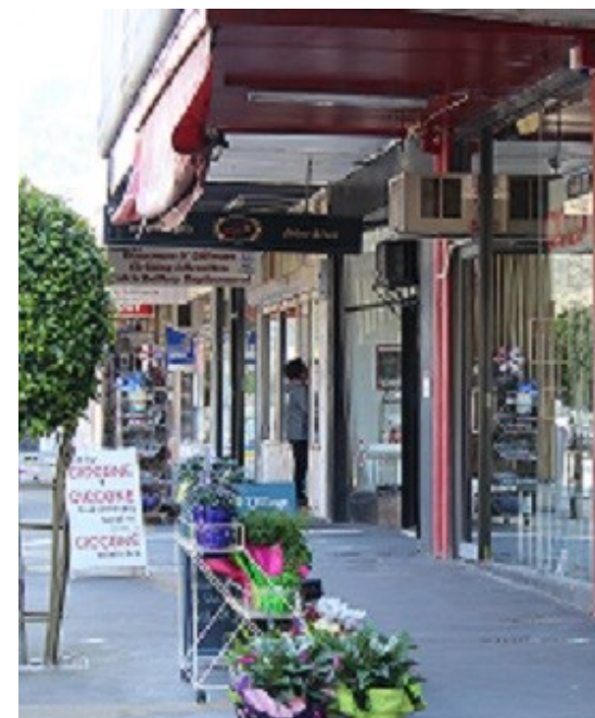
Macleod Village Shops Aberdeen Road, Macleod VIC 3085