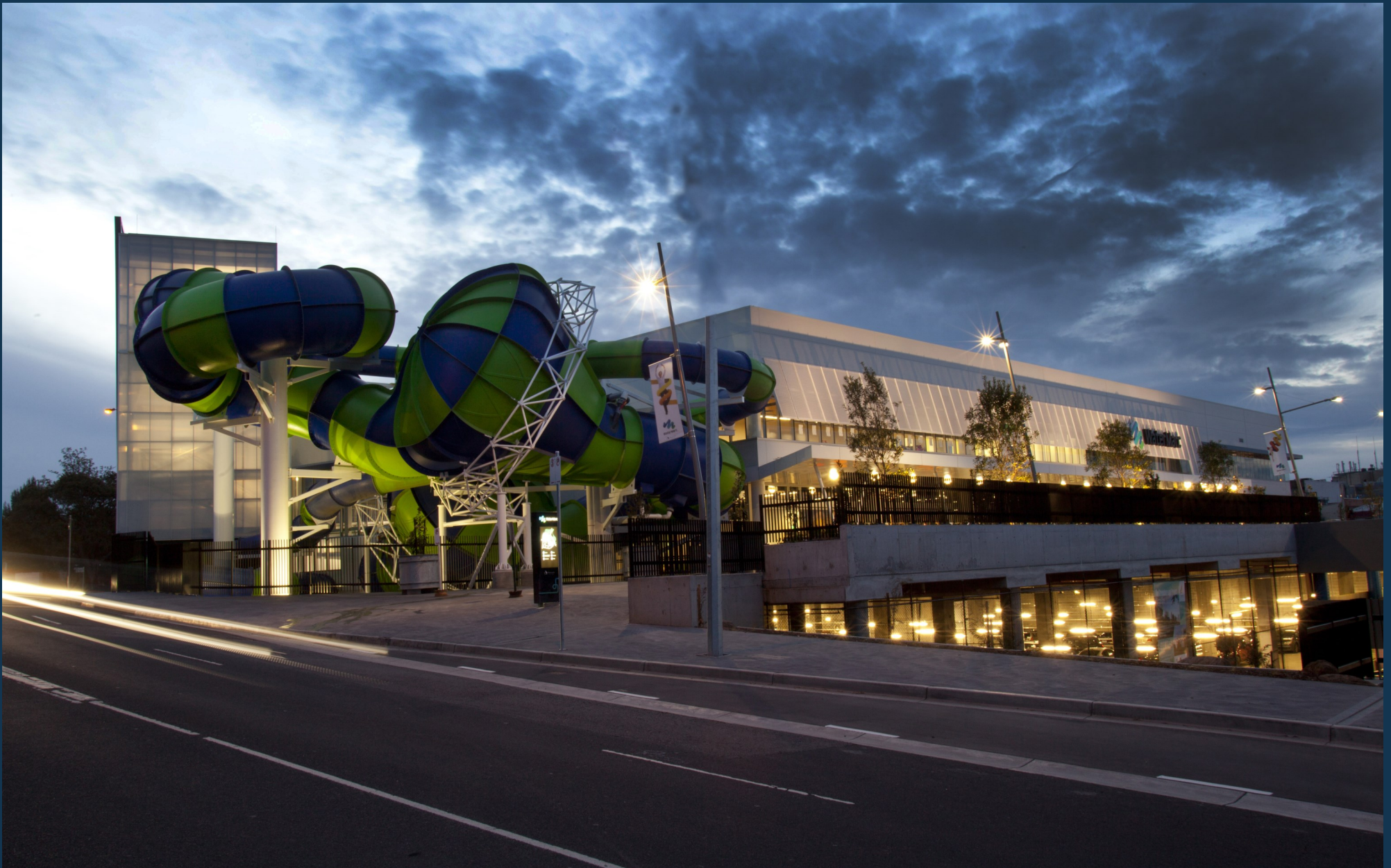
Diamond Valley Community Support 2014