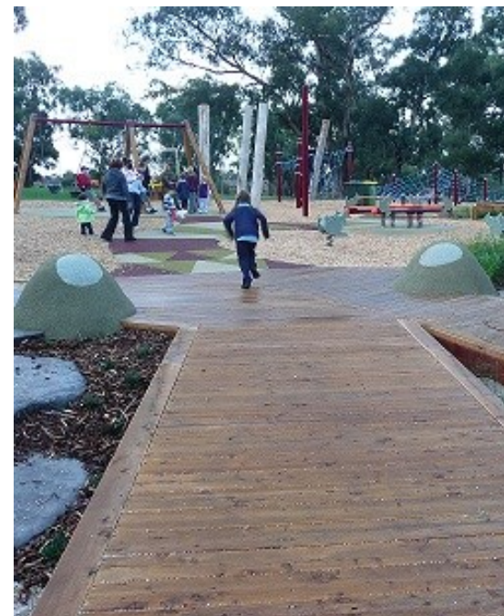
Binnak Park Anderson Parade, Bundoora VIC 3083