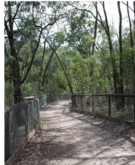
St Helena Bush Reserve Liddesdale Grove, St Helena VIC 3095