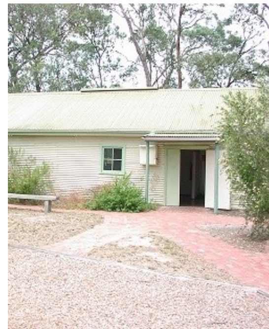
Community Hall 126 Mountain View Road, Briar Hill VIC 3088